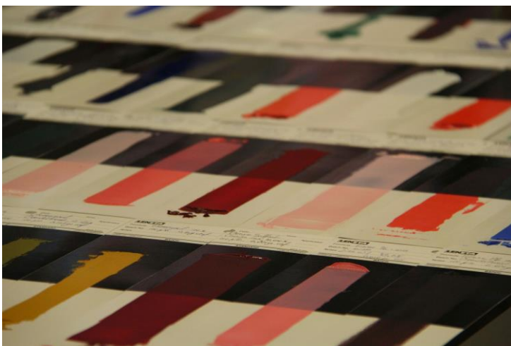
The recreated paints brushed onto opacity cards.

The linseed oil used for the project was pressed specifically for this purpose in an oil mill. The newly made paints were then brushed onto opacity cards to mimic and to measure how well or poorly Gogh's paint covered the surface and to determine its original colour characteristics.