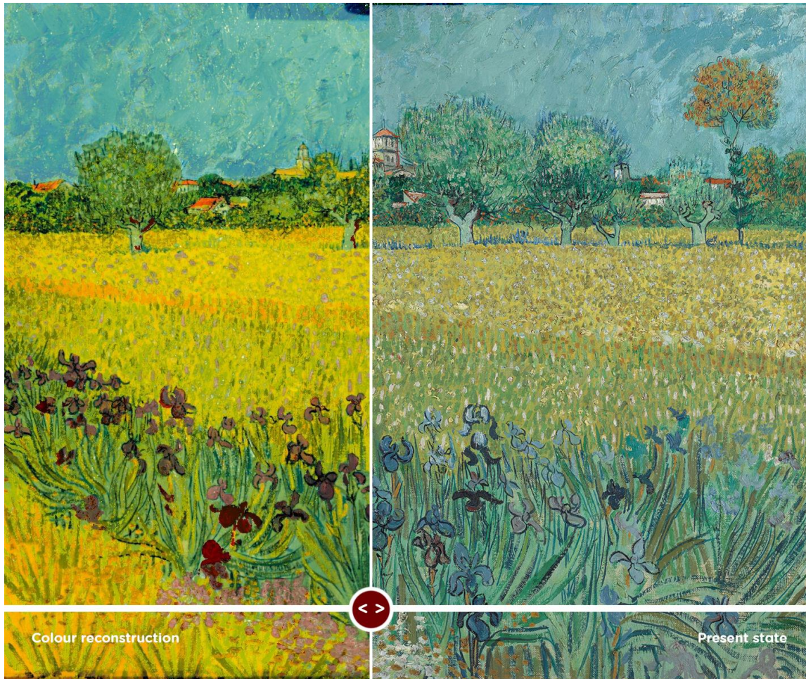
Digital reconstruction of ' Field with Irises near Arles '