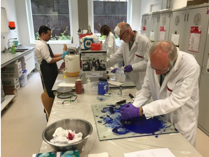
Preparing the paint

alongside historical examples from the collection kept by the Cultural Heritage Agency of the Netherlands, some of which are no longer available on the market because of their toxicity. Kremer brand pigments were also used. All the pigments were prepared using oil as a binding agent.